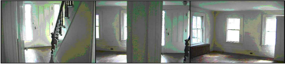
Shelter for Daydreaming.